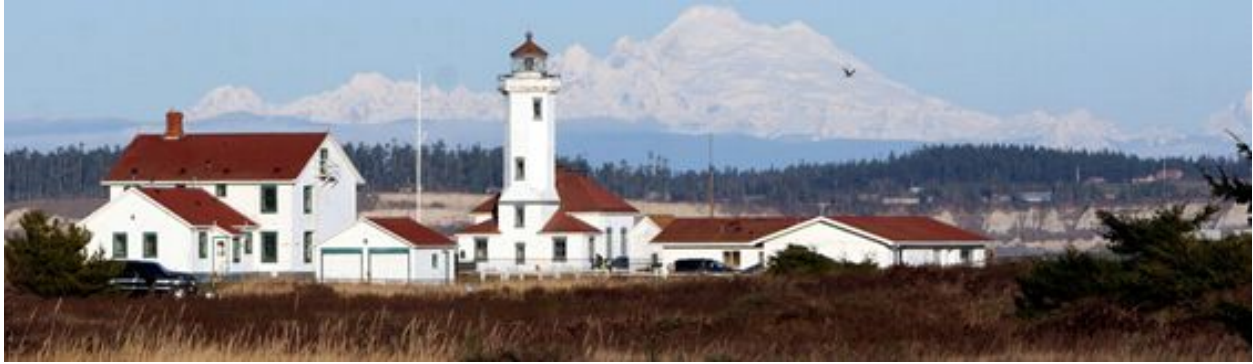
Point Wilson Lighthouse and Mt. Baker