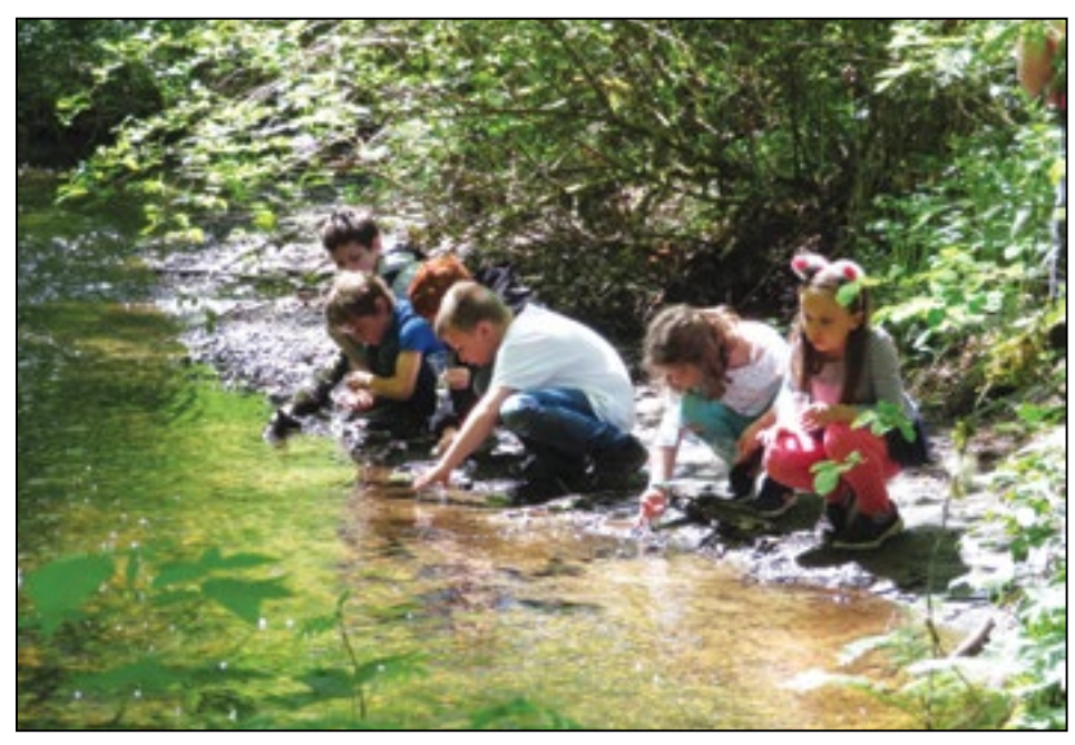
Salish Coast Students release their salmon fry into Chimacum Creek.